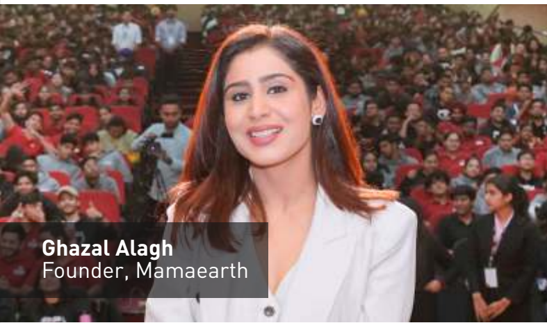
Ghazal Alagh Founder, Mamaearth