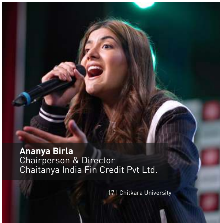
Ananya Birla Chairperson & Director Chaitanya India Fin Credit Pvt Ltd.